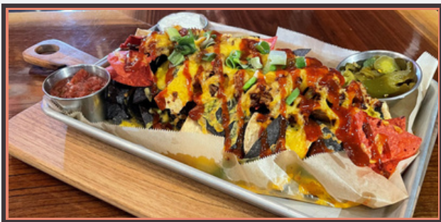
Tri-color chips, oven baked with cascades of cheese Ask your server if you would like sides of salsa, jalapenos, or sour cream